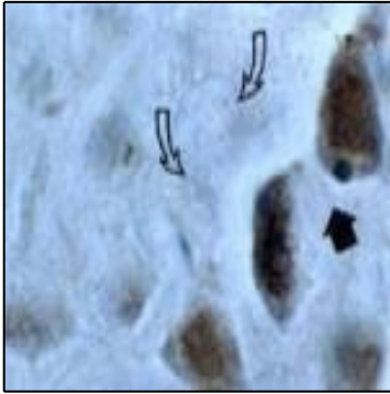
Fig:1 Formalin-fixed, paraffin-embedded section of dog ischemic brain stained for Active/Cleaved Caspase-3 expression using 20-1040 at 1:2000. Staining is seen in the nuclei of dying neurons (black arrow) but not in the morphologically normal nuclei (open arrows). Caspase-3 expression in the nucleus is considered to be a marker of active/caspase-3 expression and apoptosis. Hematoxylin-eosin counterstain.

WB: 1:1000-1:2000, IHC (paraffin): 1:1000-1:5000, IHC (frozen): Users should optimize, IP: 1:50-1:200