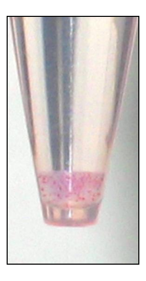
Figure 1: RalGDS-RBD Beads in Color

RalGDS RBD Agarose beads, in color, are easy to visualize, minimizing potential loss during washes and aspirations of Rap-GTP pulldown (Figure 1).