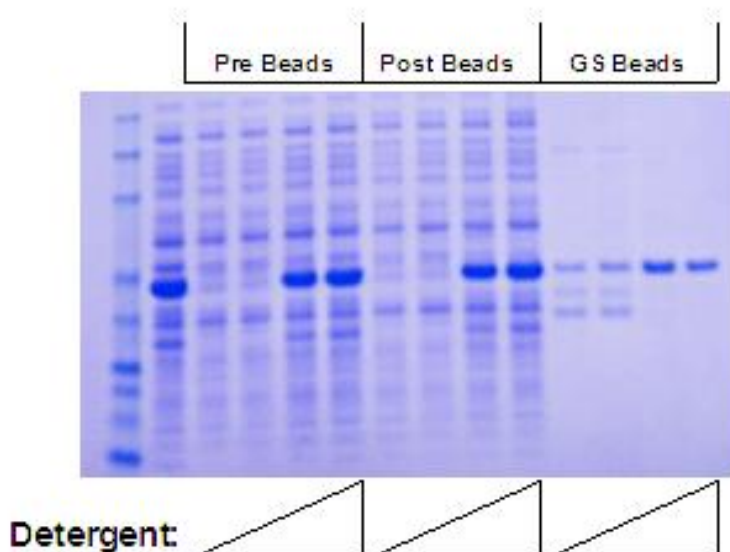
Figure 2 – Solubilization and Renaturation of GST-RTK fusion protein. GST-RTK expression was induced with 1 mM IPTG at 37°C for 4 hrs. Cell pellet was lysed, and inclusion body was solubilized and renatured under different amounts of detergent solubilization solution according to the assay protocol. Lane 1: MW STD; Lane 2: Whole E.Coli lysate; Lane 3, 7, 11: No detergent; Lane 4, 8, 12: 32-fold dilution; Lane 5, 9, 13: 8-fold dilution; Lane 6, 10, 14: 2-fold dilution.

The following figures demonstrate typical results with the Rapid GST Solubilization and Renaturation Kit. One should use the data below for reference only. This data should not be used to interpret actual results.